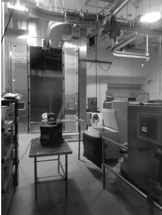
Figure 3. Synchronized HHP devices at primary injection in the necropsy suite.

and treatment reports were generated from that system. After the treatment, bioseal dampers were opened and laboratory doors unsealed for aeration through the building HVAC system. BIs and CIs were collected and processed as in Study 1.